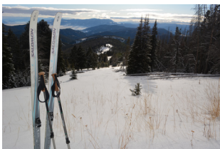
off Diego Town Road

From Boulder, follow Highway 69 south for 7 miles, and turn left at the Elkhorn sign onto White Bridge Lane. Cross the Boulder River and continue right for 3 miles, keeping left at your first junction then left again onto Elkhorn Road another 8 miles into Elkhorn.